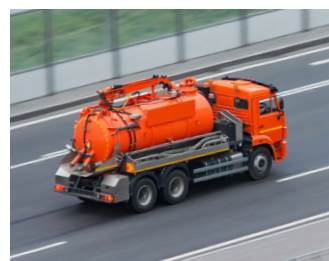
The system slows the machine near the danger zone.