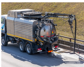
Boom height & rotation limit indicator.