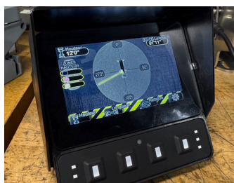
User friendly and rugged tablet for maximal visibility.